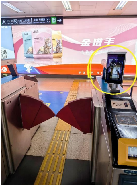
Face-recognition device at the Wangfujing subway station

Advancing in this and that, China also needs to strengthen the communication with international patients to make things smooth for them based on bilateral timely and high-